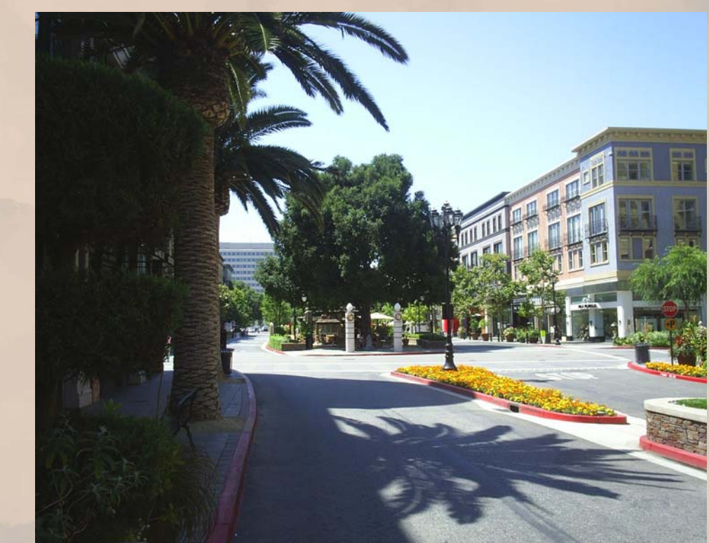
Care has been continuous for two years. Work has included pest and disease control and the maintenance of soil moisture and nutrient levels.