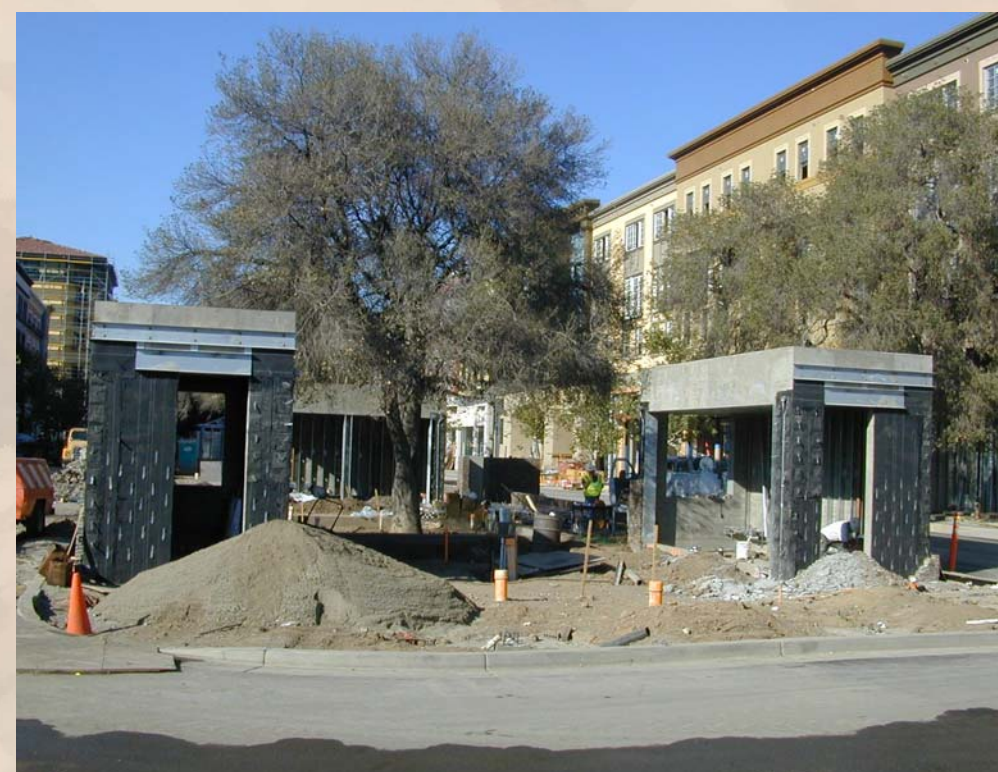
This oak was replanted after 18 months out of the ground.

The transplanted trees provided the central pivot around which this community was built. The Oaks are now the center of business and recreational life at Santana Row. This type of high density development is a good example for future urban renewal projects that can still accommodate the aesthetic and functional benefits of trees.