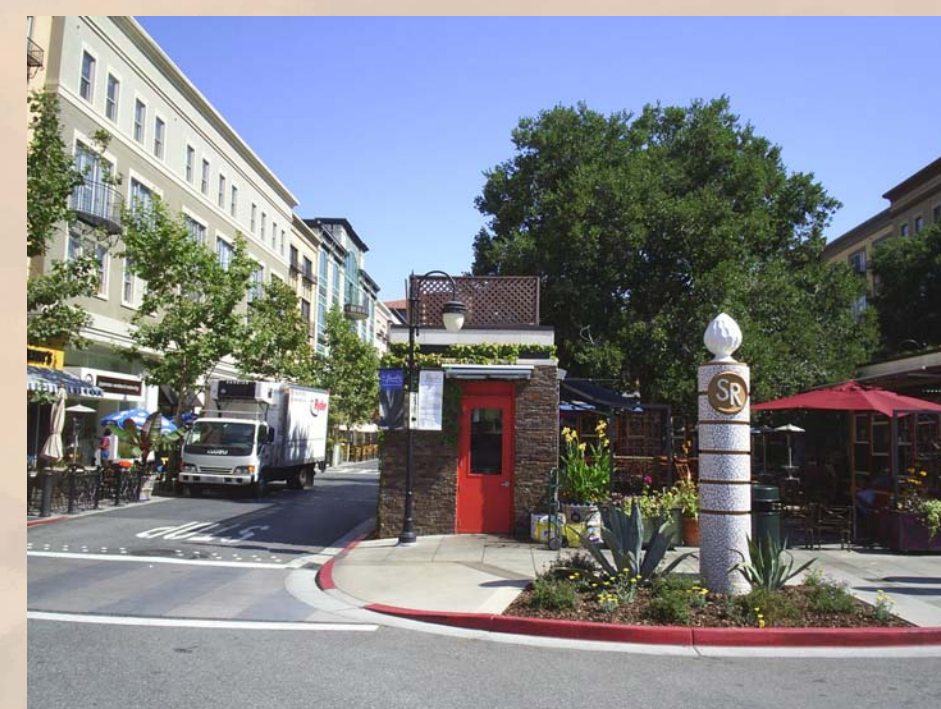
This was the only tree left in the ground throughout construction and had to be protected.